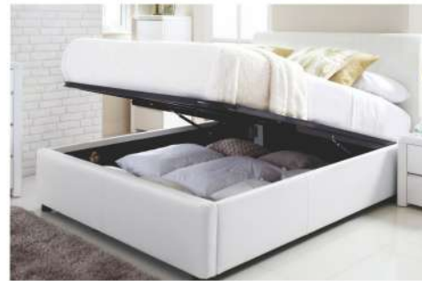
Hydraulic gas lift